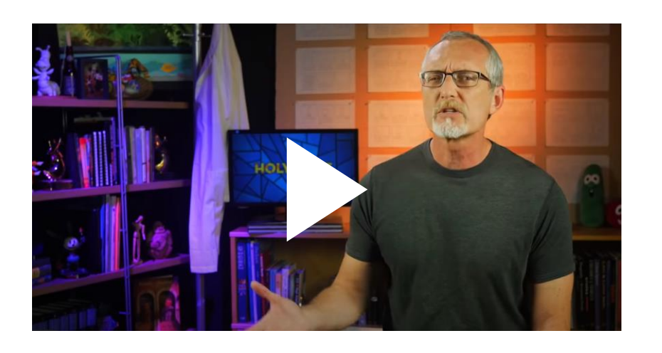
VIDEO: Race in America